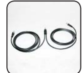
SMA Power Balancer Y cable PBL-YCABLE-10