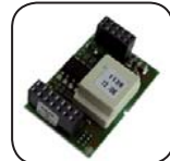
RS485 interface of type 485PB-NR